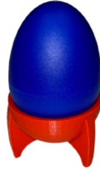
ROCKET EGG CUP ~ 1 hour