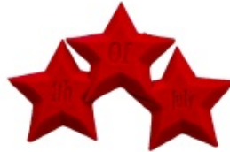
4TH OF JULY STAR STACK ~49 MINS