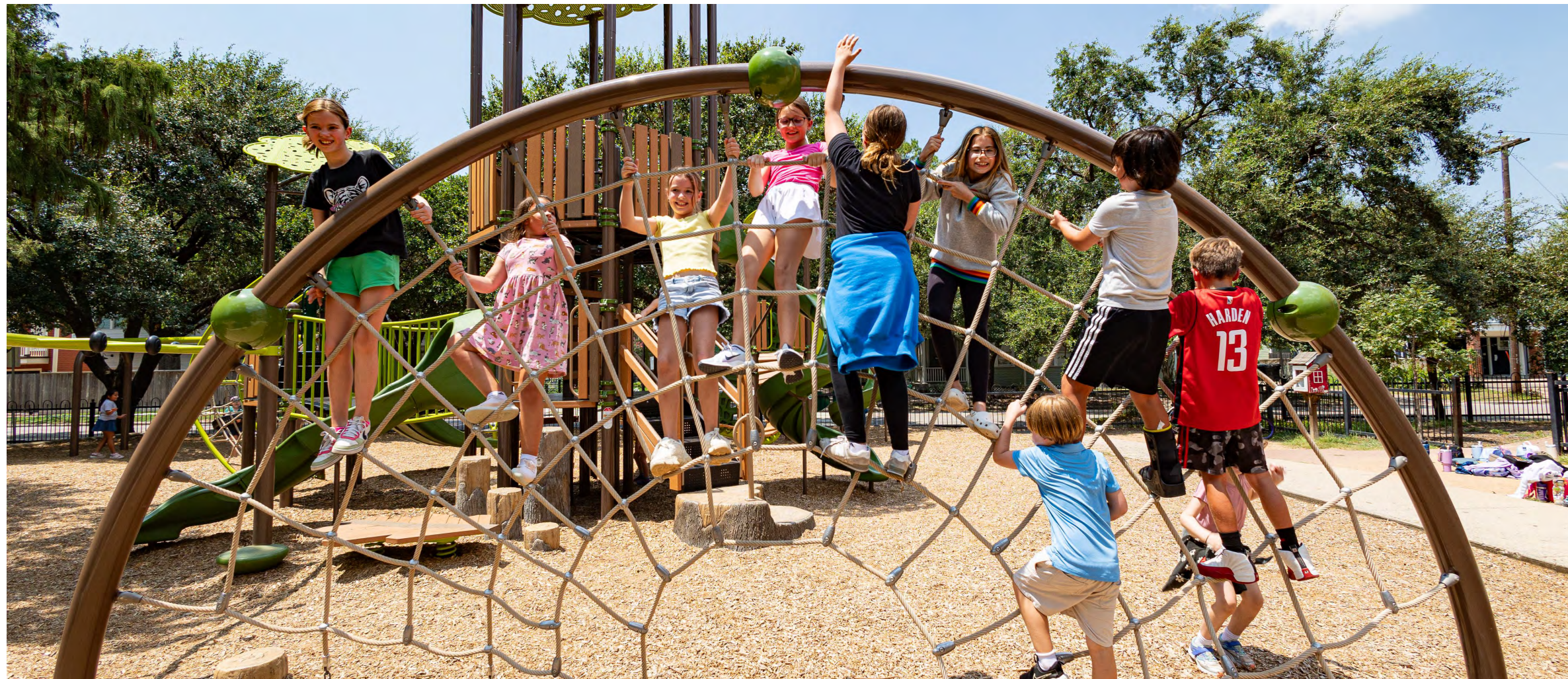
ROPE COURSE PLAY