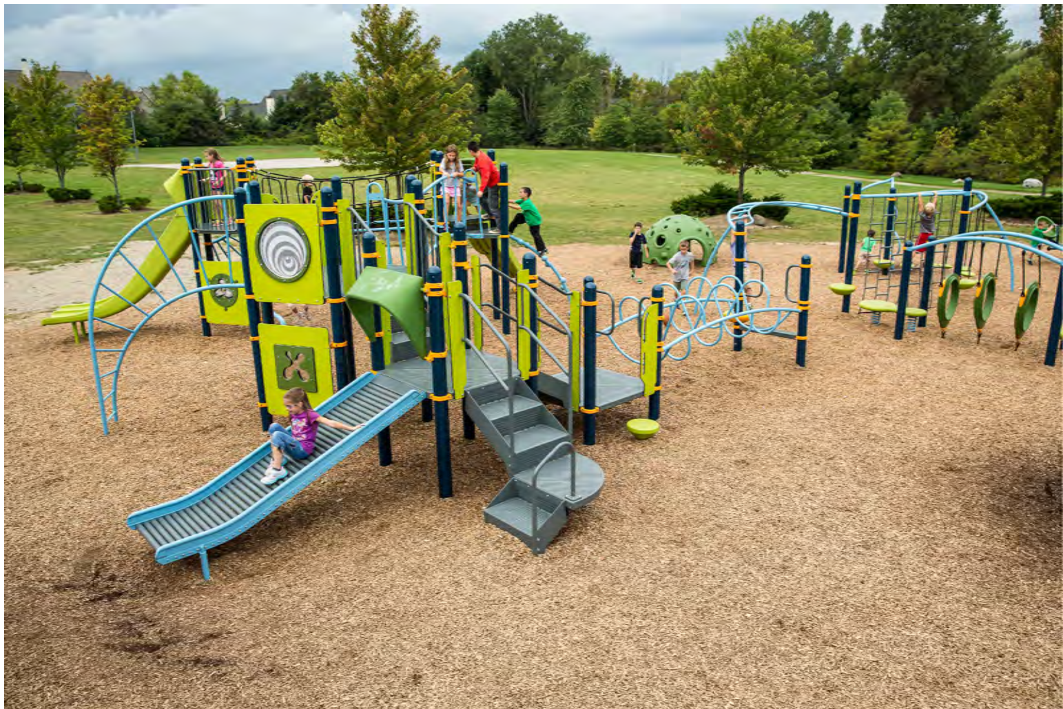
POST & PLATFORM