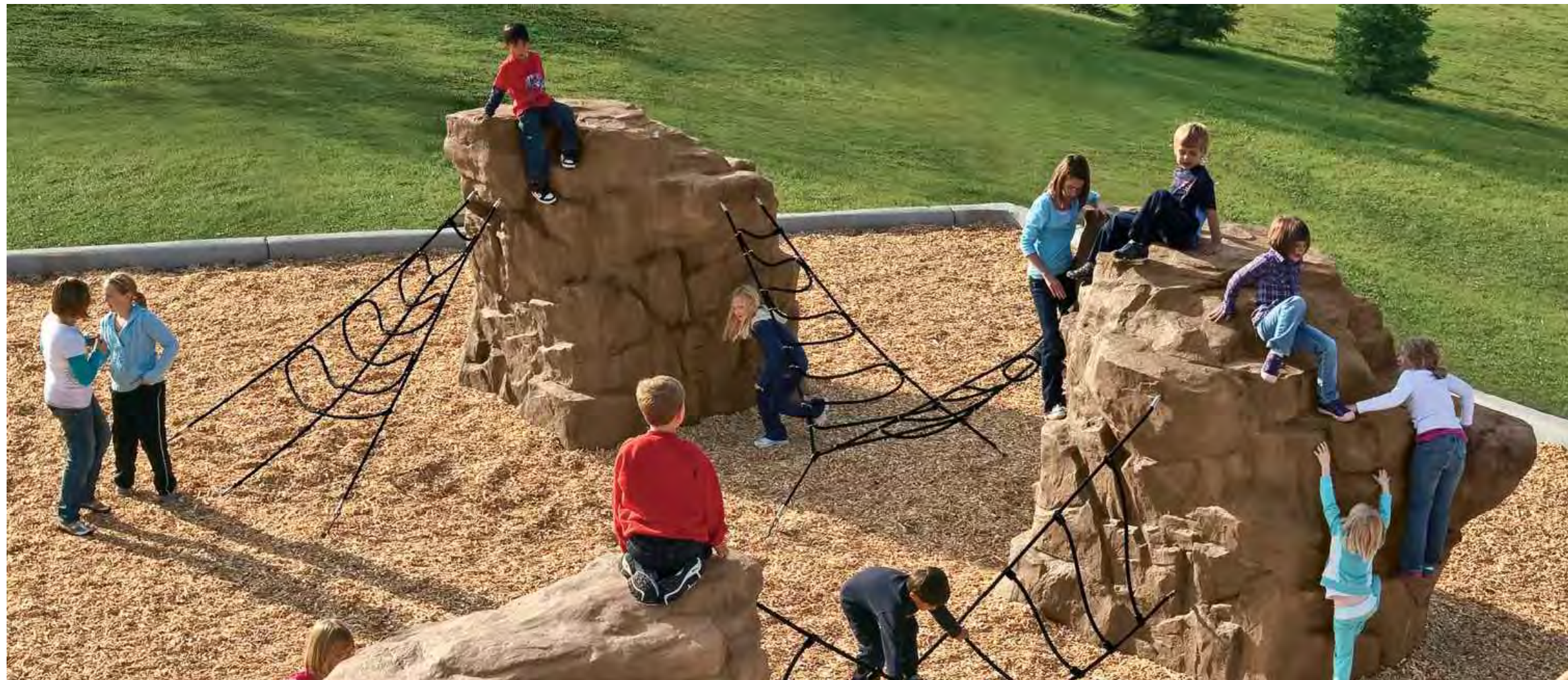
NATURE THEMED PLAY